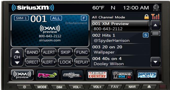
XSG2NA-X2 7" Infotainment System