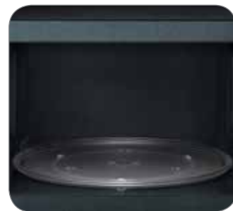
Ceramic Enamel Interior