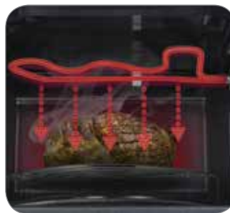
Grilling Element with Ceramic Plate